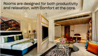
Rooms are designed for both productivity and relaxation, with comfort at the core.

The hotel also delivers an elevated dining experience with multiple options to suit diverse palates. At the lobby-level Tea Lounge, guests can enjoy a curated selection of signature teas paired with local delicacies. Mirasa, the all-day dining restaurant, offers an eclectic mix of international dishes and locally inspired fare, made with fresh regional produce and premium imported ingredients—refined by the artistic flair of the hotel's in-house chefs. Ariva – The Bar invites you to unwind in style, while the poolside deck transforms into a chic Mediterranean-style dining venue in the evenings.